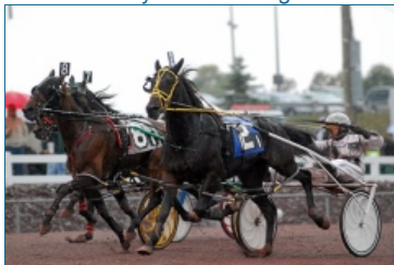
Image Gallery for PD celebrating 50 years of racing

PLAINS TWP. — The ceremonial ribbon-cutting was July 15, 1965.