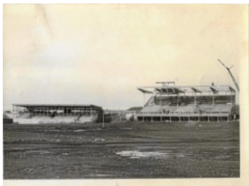
Image Gallery for PD celebrating 50 years of racing